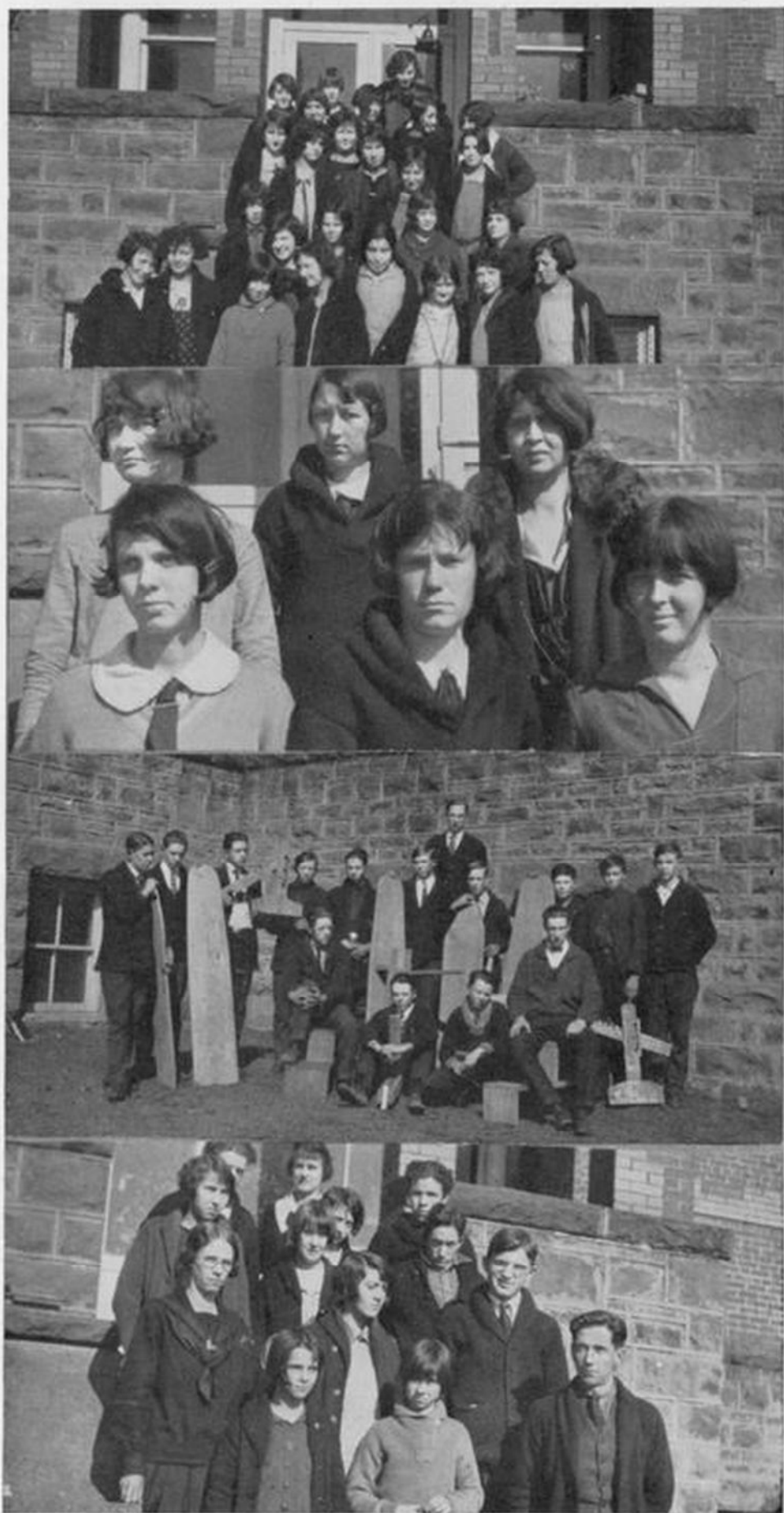
Home Economics—Normal Training—Vocational—Agricultural page thirty-four Music and Art.